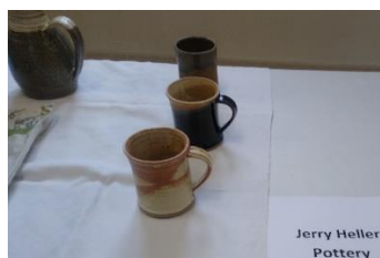
Jerry Heller Pottery

Ring, Ring, it's time again to ring the bell for the Salvation Army once again on November 26 th . The sign-up sheet is on the bulletin board by the elevator. Please pick a time and ring the bell.