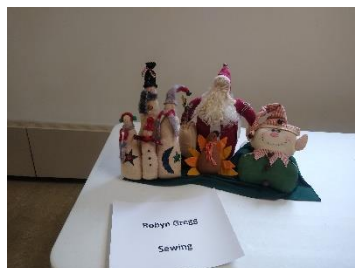
Robyn Orsini Sewing